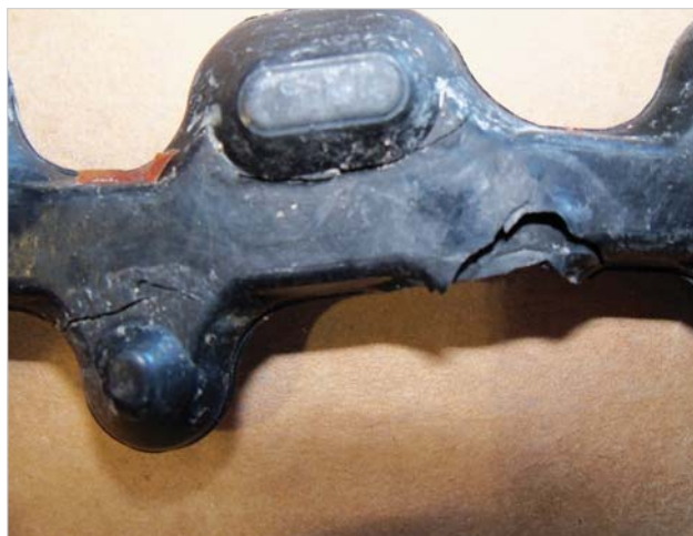
Non-OEM gaskets will cost you! The substitute gasket shown failed in less than 3 months, resulting in unplanned downtime and excessive maintenance costs.