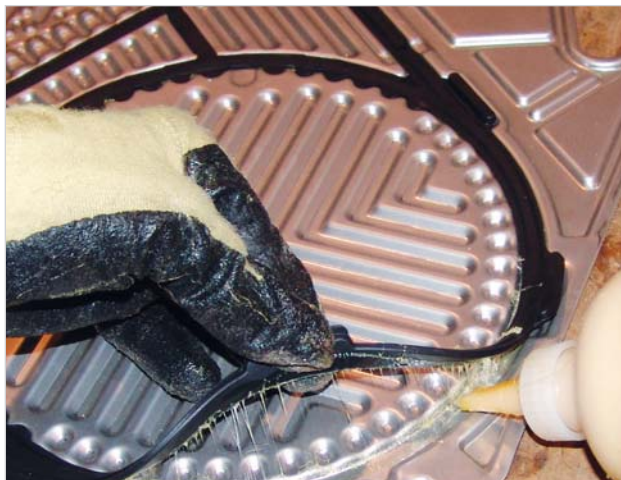
Plates are regasketed with OEM replacement gaskets and OEM-spec adhesives.

5. Tranter sequentially marks complete plate packs for ease of handling and proper orientation when installing plates. Current unit drawings are provided with each shipment.