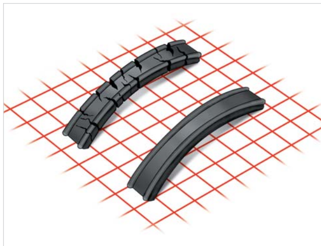
Non-OEM elastomer compounds combined with non-OEM and/or duty-mismatched adhesives are a certain formula for rapid gasket failure (top).