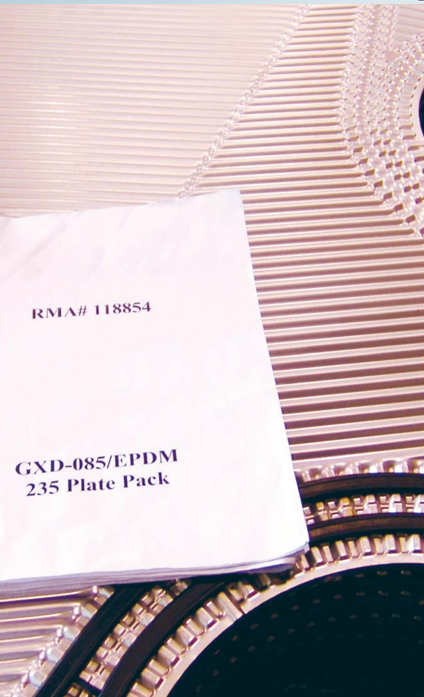
Complete plate pack refurbishment with OEM materials and procedures.