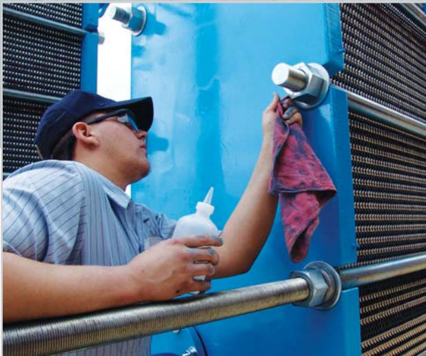
Plate & Frame Heat Exchanger Reconditioning Services