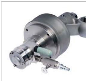
Stainless Steel Air Motor