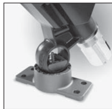
Cup Plate Assembled