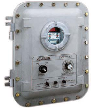
WPC-9001-XP (Nema 7) For Hazardous Locations