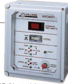
WPC-9001-GP (Nema 4x) For General Purpose Locations

The WPC-9001 is designed to receive a 4-20 mA input signal and generate a 24 VDC square wave output pulse. The pulses alternately energize and de-energize a 3-way solenoid valve, which in turn provides the air to operate the pump.