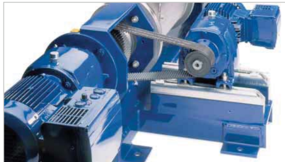
Detail: Ribbon auger drive

Universal Joint sleeve with holding bands protects the grease-filled joints from penetration of the liquid pumped, even in case of maximum vacuum or pressure loading; streamlined design to reduce turbulence and NPSHr.