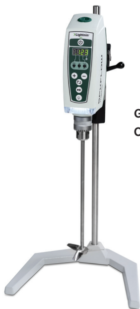
GP2 Universal Clamp Mount