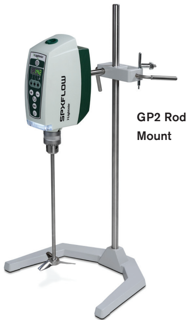
GP2 Rod Mount