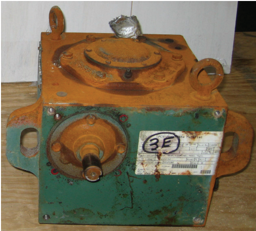
70 Series Gearbox returned to SPX

SPX Lightnin is the only supplier of original equipment for Gearbox Exchange Services for industrial mixers and agitators. Exchange services allow the customer to get a direct replacement gearbox for a fraction of the cost of a new one. Lightnin's 48-hour "Break-down" delivery limits your scheduled down time, thus reducing your production losses to a minimum. Lightnin's exchanges are held to original manufactured standards and include the same warranty as new equipment.