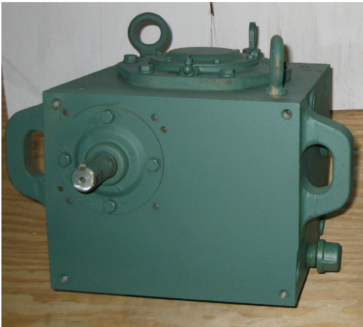
70 Series Gearbox exchange returned to client